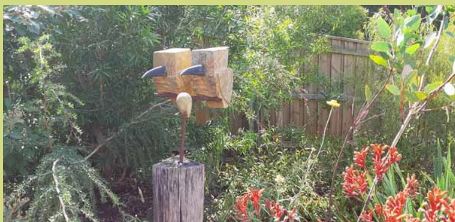
Quirky garden sculpture of kookaburras in the garden at “Stoneacre”