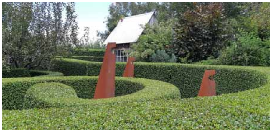
Spiralling hedge in Wychwood

If you would like to participate in Garden Club activities, please call or email me.