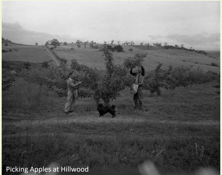
Picking Apples at Hillwood