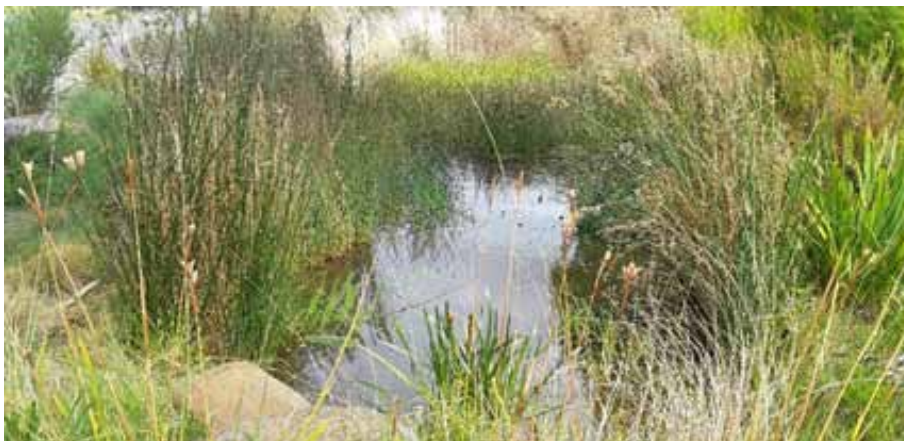
The pond at “Stoneacre

This property is approximately 1-1/2 acres. Rosemary and her husband, Alf, moved here four years ago. At the time, the garden consisted of exotic plants with mature deciduous trees and lots of hellebores and daffodils. Since then, they have undertaken a major renovation of the house and made changes to the garden with an emphasis on having more Australian plants which has increased the birdlife and biodiversity. They have added a pond and bog area and allowed the natural grass patches to go unmown for 12 months at a time.