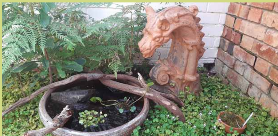
A shady corner with pond guarded by dragon and surrounded by native violets