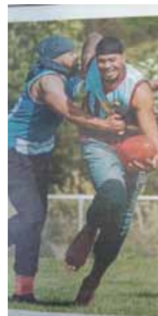
From the Examiner