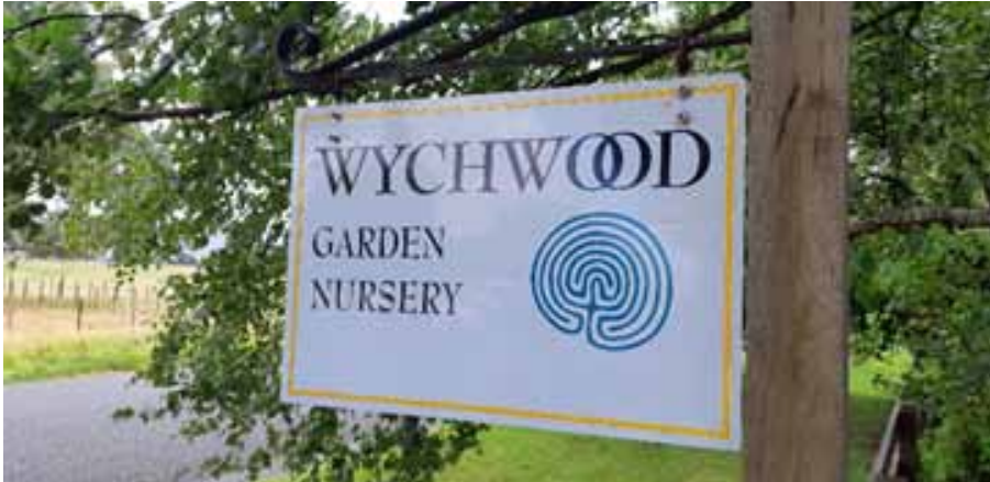
The Labyrinth motif