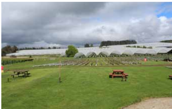
Growing Tunnels at Hillwood Berries PYO Strawberries in Front

It's a great spot to take visitors for a coffee, or maybe a strawberry milkshake?