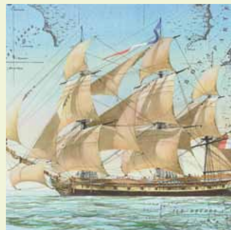
Baudin's Vessel Geographe