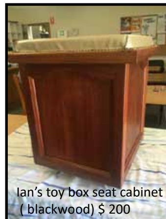
Ian's toy box seat cabinet ( blackwood) $ 200

There are quite a number of good news items we are keen to share in the next edition once they have been finalised. So watch this space.