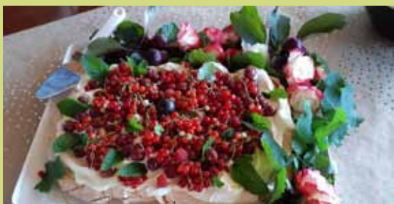
A very Christmassy pavlova!