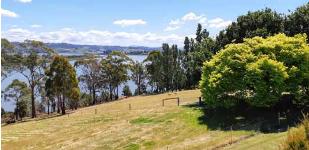
View over the Tamar Estuary from "Tarcoola"

I think that everyone will agree that we in Tasmania, have been very fortunate to be living on this beautiful island where we have been able, for many months, to experience relative (but cautious!) freedom to move around. Not only that, but how fortunate are we to enjoy this lovely community of garden lovers! We welcomed quite a few new members in 2020 and look forward to a long and happy association with you all.