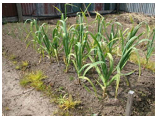
Garlic plants in August

March-April is an ideal time to sow garlic for best results. Strong leaf growth before the Winter cold sets in will assist the plant to store food in the later Spring months before harvest in December. There are many different types of garlic, but I have had success with the pink Italian type obtainable from Allan's Nursery in Prospect at present. Prepare your soil for the garlic by digging in Dynamic Lifter pellets and or sheep manure. Garlic is a hungry feeder and requires a balanced soil. Break the cloves away from the bulb and sow them with the pointed end up at a depth of about 2.5cm. Plant about 25 cm between cloves for best root growth. Water in well and wait until the leaves emerge from the soil about 2 weeks after planting. Side dress in Spring with further pellets or apply Seasol to the leaves every two weeks during spring growth. When the plant starts to set a bulb you can stop fertilising but keep up the water until the leaves start to fall over. At this stage it is preferable that the plants do not get a lot of water or they won't keep well. When the leaves have fallen over in early December, you can lift the plants and lay them on the top of the bed until they dry completely. Plait the garlic into strings and hang in a cool dry place.