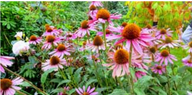
Beautiful echinacea at Birchgrove Gardens