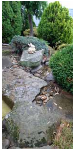
Lucky rabbit in Kings Meadows!