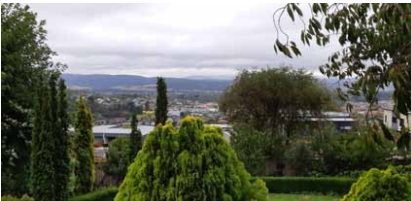
The view to the mountains from Kings Meadows

The small lawn areas are bordered with concrete, and curved concrete paths with aggregate topping providing access to most of the garden. Amazing views to the mountains are visible from the garden as well as the house. The day we visited was wet (we didn't complain – all rain is welcome) but we did manage to walk around the garden during a break in the rain. Thank you to Wendy and Dennis for a lovely afternoon.