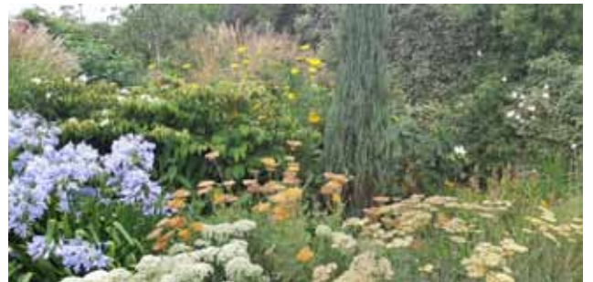
Golden yarrow and agapanthus at Birchgrove Gardens