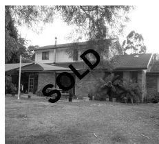
439 Golconda Rd, Lilydale