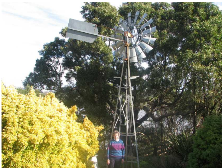
..It's an intriguing garden, with small paths, steps with an old windmill