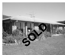
71 Lalla Rd, Lilydale