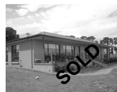
79 Jetty Rd, Hillwood