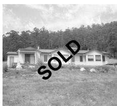
327 Rowleys Hill Rd, Karoola