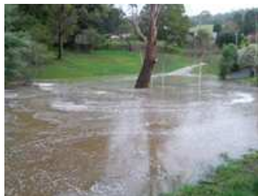
The water flowing from the hillside through a natural gully, banks up from a blocked drain to come within centimeters of the floor level of the house to the right of the picture.

Initial treatment centres around drinking plenty of fluids and simple analgesia (paracetamol or nurofen) if symptoms persist after a few days or if vomiting in particular prevents adequate fluid intake then medical advice is warranted, like wise especially in children if the temperature stays above 38 after Panadol or nurofen seek medical advice. Keep in doors and avoid contact with other people if at all possible.