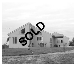
129 Johnstons Rd, Hillwood