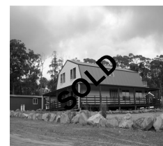
71 Bullocks Head Rd, Mt Direction