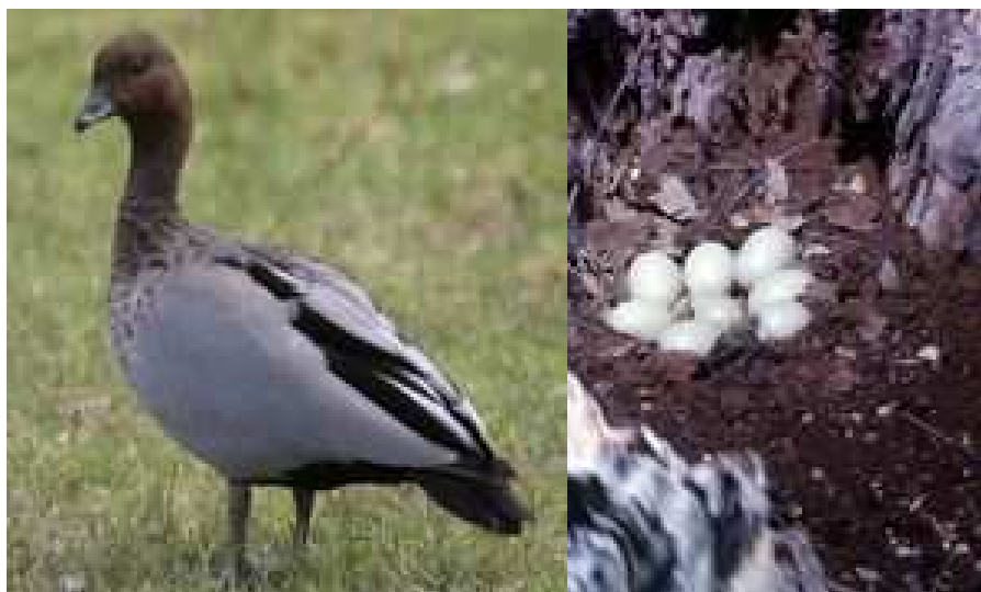
A male Wood Duck . . .A clutch of 8 eggs in a tree hollow at about head height