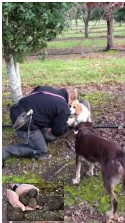
Truffle dogs at work to find ripe fungus .

http://www.winderdoon.com/comm unity/smokesignals.htm