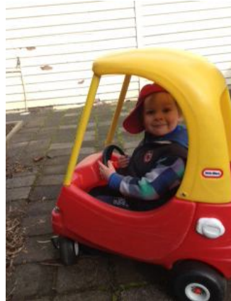
Fun activities at Playgroup