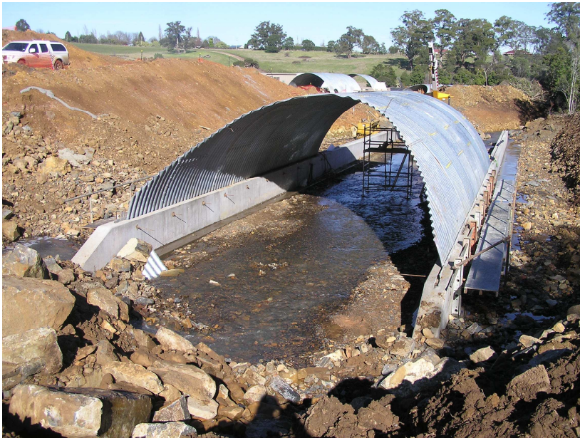
Culvert installation at Lady Nelson Creek

We are privileged to share the development of our highway Bypass. As residents, each day we see the amazing changes and infrastructure that will change our world before too long. We see the delays to work, caused by rain that is so welcome to us, but so frustrating to the contractors who need to plan for these delays and their workforce. We will forget this and take it for granted in the not too distant future. We see up close the changes that are implementing our wish: to have a peaceful community with safe access for our families. Smokesignals is grateful for the co-operation of the personnel at DIER for the report and photos in this edition.