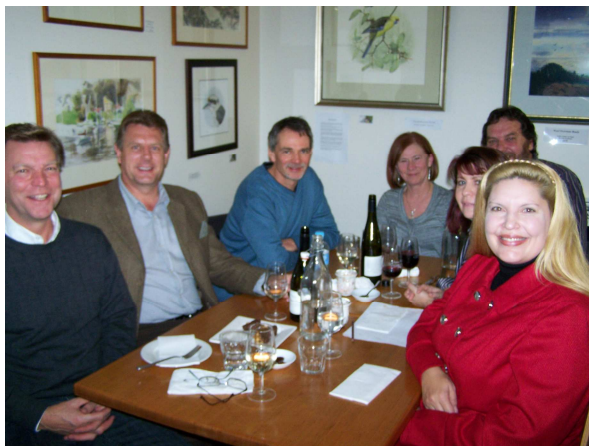
A happy table of locals at the Windermere Café's wine & food pairing evening.

We are privileged to share the development of our highway Bypass. As residents, each day we see the amazing changes and infrastructure that will change our world before too long. We see the delays to work, caused by rain that is so welcome to us, but so frustrating to the contractors who need to plan for these delays and their workforce. We will forget this and take it for granted in the not too distant future. We see up close the changes that are implementing our wish: to have a peaceful community with safe access for our families. Smokesignals is grateful for the co-operation of the personnel at DIER for the report and photos in this edition.