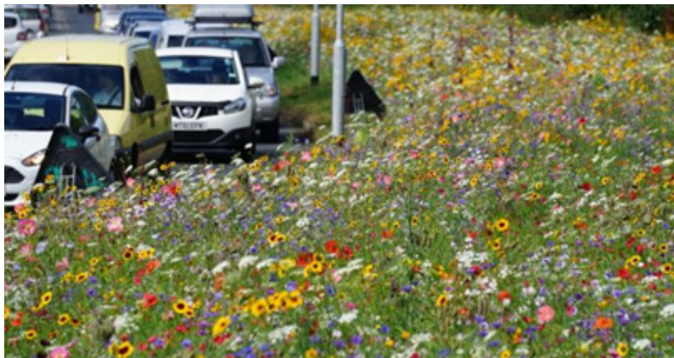
Rotherham Council: Eight miles of roadside wildflower meadows

In the UK more than 65,000 people have now signed a petition encouraging councils across the UK to allow wildflower meadows to grow on roadside verges. Councils seem to be listening. In just one example Rotherham Borough Council has established eight miles of meadows alongside a motorway, saving £23,000 per year on mowing costs.