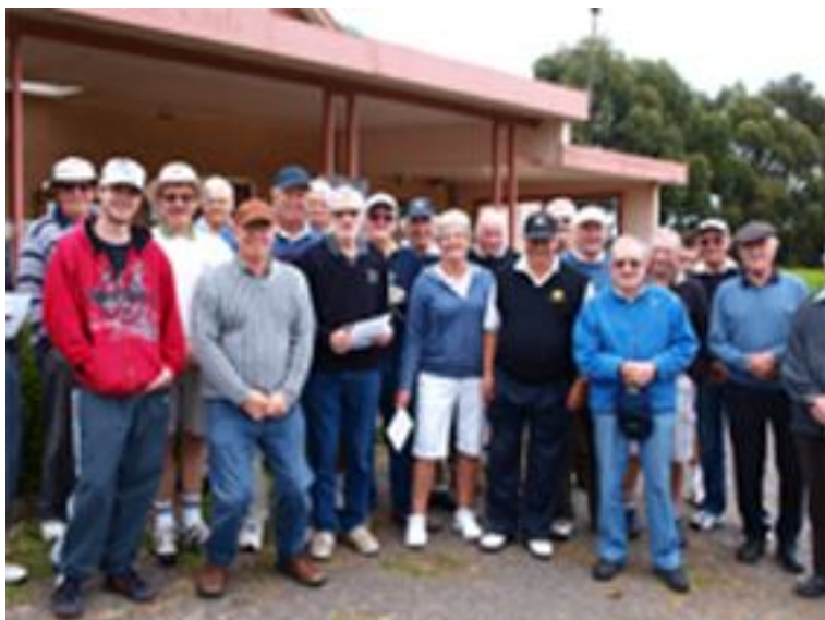
Participants in The Golf Day.