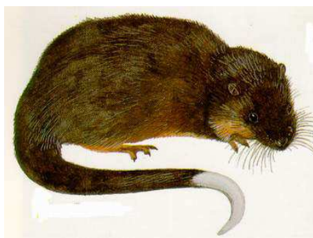
Native Water Rat: Hydromys chrysogaster