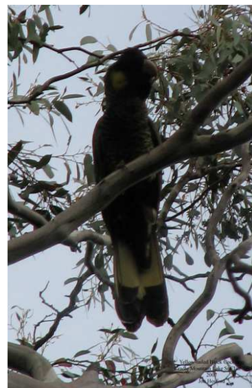
This photo in B+W does not do justice to these beautiful larrikins.

Next time you hear the familiar "keeow" call, look up and appreciate the slow magnificent flight of these birds.