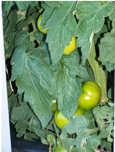
This photo was taken this week from my crop of winter tomatoes.

Broad beans can be sown now for bearing in November . Sowing them earlier than May-June will not produce mature beans any earlier, however greater vegetative growth will provide more beans.