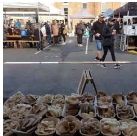
Jordan's Stall at Harvest Market