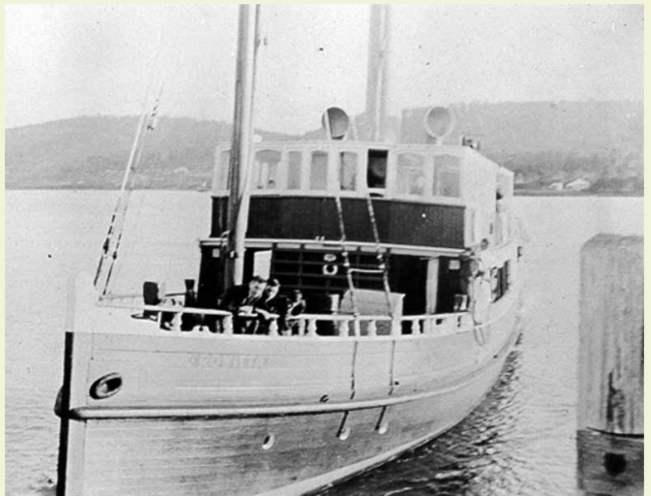
Tamar River Ferry SS Rowitta

Many of the river ferries were also used for pleasure cruising