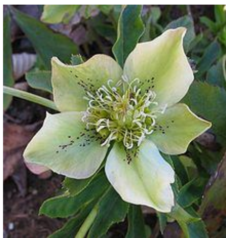
A flower of Heliboris x hybridus with olive-green nectaries visible behind the stamens