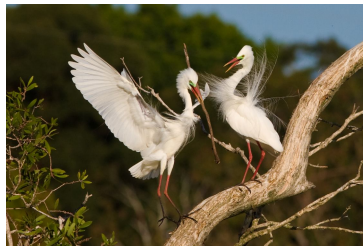
Courting Intermediate Egrets