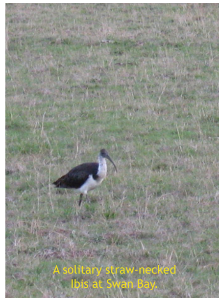
A solitary straw-necked ibis at Swan Bay.

The Straw-necked Ibis is a significant contributor to the control of agricultural pests which build up in large numbers due to intense cropping.