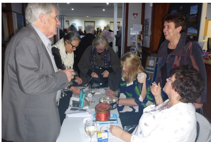
A busy night at the Art Show