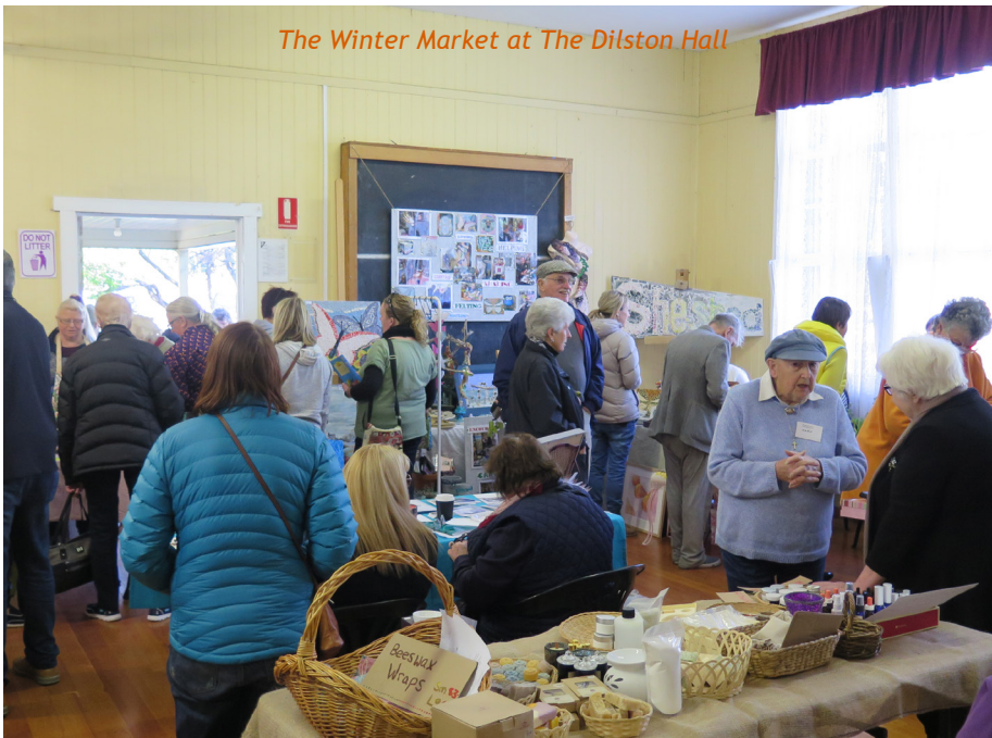
The Winter Market at The Dilston Hall