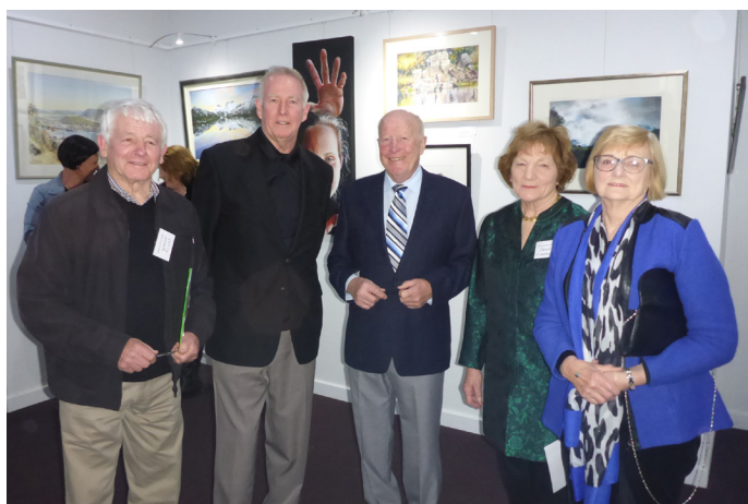
A very enjoyable AND successful night