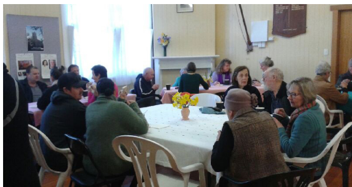
"Soup, Sandwich, Slice" Luncheon