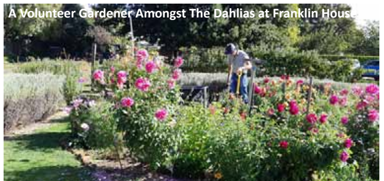
A Volunteer Gardener Amongst The Dahlias at Franklin House

APRIL - Franklin House garden was our destination for lunch in April. This beautiful National Trust property is situated at Youngtown, amongst more modern buildings, and is a small oasis from a bygone era, with a well-established garden and some wonderful volunteers who maintain the garden. Our visit was timed to coincide with the volunteer gardeners' working day, which meant we had a guided tour and could chat with the gardeners. It was a very relaxed day in some lovely autumn weather, with trees beginning to show colour. We enjoyed lunch in the garden and some of us enjoyed a Devonshire tea on the veranda of the old house.