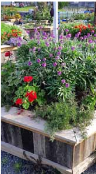
Raised Garden Beds Built by ETMS