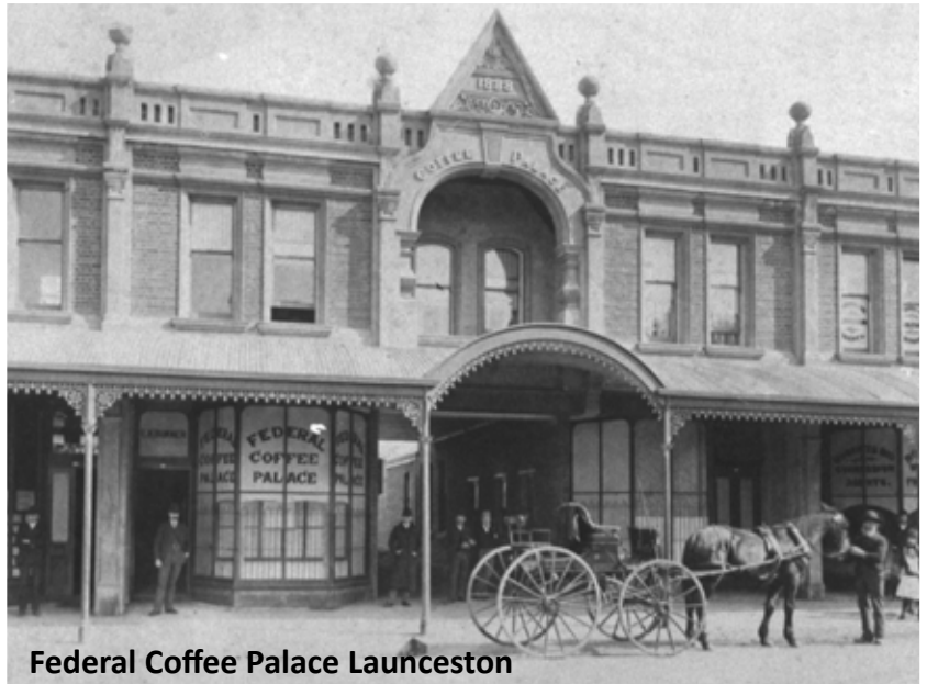
Federal Coffee Palace Launceston

Over the 40 years from 1880, there were more than 20 coffee palaces in Launceston and surrounding satellite towns like George Town, Beaconsfield, Evandale and Perth.