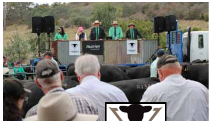
Landfall Open Air Bull Sale

FOOTNOTE: Most of us have seen the cattle browsing on a dark green fodder crop – its fodder beet which, as you can see, grows to a remarkable size.