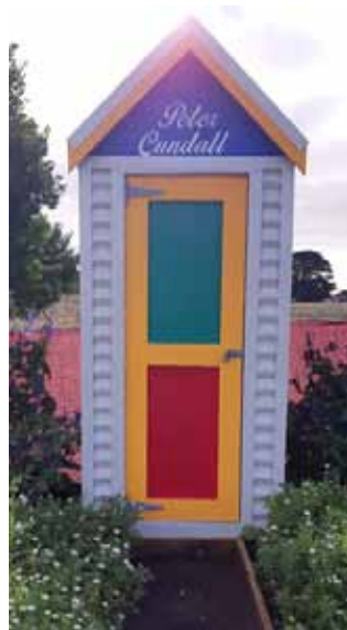
The Peter Cundall "Bathing Box"

MAY – took us to a private garden in George Town and to Low Head Community Garden. Judy's garden in George Town is a haven for Australian native plants as well as a wonderful collection of salvias. Low Head Community Garden - which is only six months old! - has already evolved as a wonderful resource for the local community. Their first and most important aim is INCLUSION, and as such, they have installed raised garden beds for those who have limited mobility. The raised garden beds were built by none other than our local Men's Shed – East Tamar Men's Shed (ETMS).