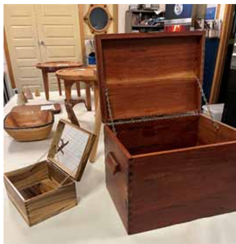
Items for sale made by members

It has been another busy couple of months at the East Tamar Men's Shed with orders for projects coming from community members underway with others having been completed and delivered. Recent requests have included a garden swing set, more raised garden beds, replacing handles in axes, turning missing spindles for an antique dresser, making a display cabinet for a rock collection and more. Members have also been busy on their own restoration and small building projects as well.