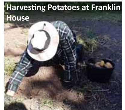
Harvesting Potatoes at Franklin House

APRIL - Franklin House garden was our destination for lunch in April. This beautiful National Trust property is situated at Youngtown, amongst more modern buildings, and is a small oasis from a bygone era, with a well-established garden and some wonderful volunteers who maintain the garden. Our visit was timed to coincide with the volunteer gardeners' working day, which meant we had a guided tour and could chat with the gardeners. It was a very relaxed day in some lovely autumn weather, with trees beginning to show colour. We enjoyed lunch in the garden and some of us enjoyed a Devonshire tea on the veranda of the old house.