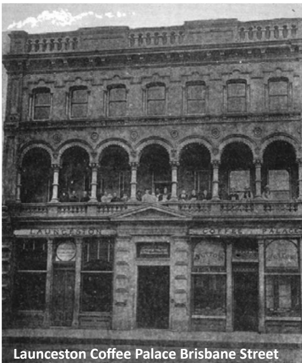
Launceston Coffee Palace Brisbane Street

It featured 29 bedrooms, a dining room and a separate ladies dining room, a refreshment bar, a confectionary shop, a reading room, smoking room, two drawing rooms (one with a grand organ and one with a piano), a billiard room, a first floor balcony with seven Corinthian columns, and a bakehouse.