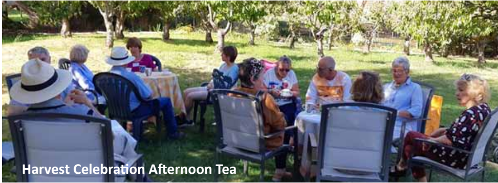
Harvest Celebration Afternoon Tea

MARCH - Our Harvest Celebration was held on a cool but pleasant autumn afternoon at the end of March, at Windsong in Windermere. Our Harvest Table was adorned with many delights – apples, pears, herbs, pickles, cakes, jellies, and we happily traded these delights with each other. There were enough apples and pears to donate to Evelyn's Garden Harvest for Schools Project as well.