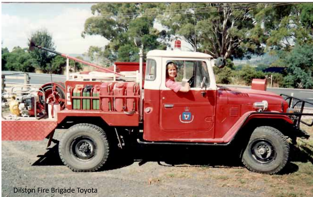
Dilston Fire Brigade Toyota

International. Next stage was to find the money to equip it.