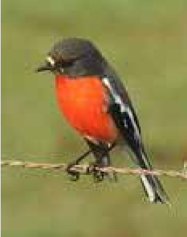
Male Flame Robin

M ale Flame Robins have a bright orange breast and throat, and are white on the lower belly and undertail. The top of their head and back is dark slate grey and there is a clear white stripe on the folded wing. The bill is black and the legs dark brown. The female is quite different from the male, being mostly grey-brown with a pale buff wing stripe, and a mostly white outer tail feather. Young Flame Robins resemble the adult female, but the brown of the back is heavily streaked with buff and the pale belly is streaked with brown.