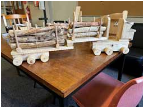
Wooden car carrier and log truck for sale