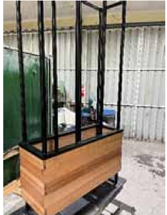
One of the 3 planter boxes