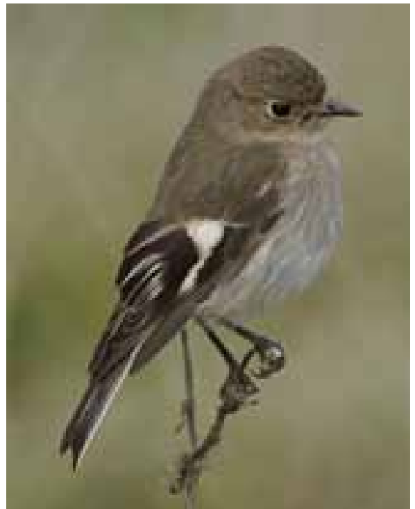
Female Flame Robin.

Flame Robins and Scarlet Robins are often seen in gardens and open woodland in Tasmania. They predominantly feed on insects amongst leaf litter and can be seen perching on fences and posts where they obtain a good vantage point for hunting.