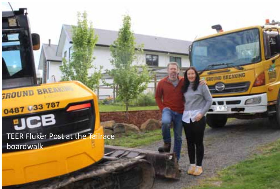
TEER Fluker Post at the Tailrace boardwalk

our client's expectations and provide a stress-free experience from start to finish."