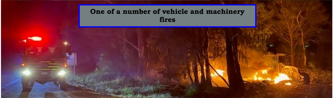
One of a number of vehicle and machinery fires