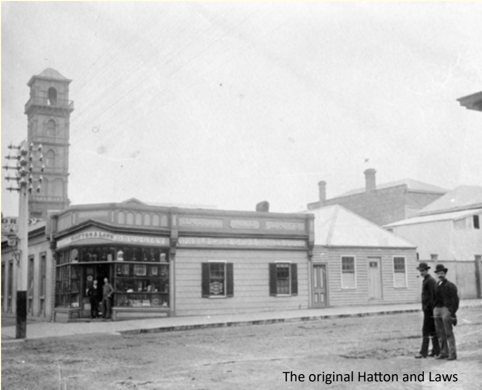
The original Hatton and Laws

Pharmacies have existed in Launceston since 1829, but in those days were known as “chemists and druggists” or “apothecary shops”