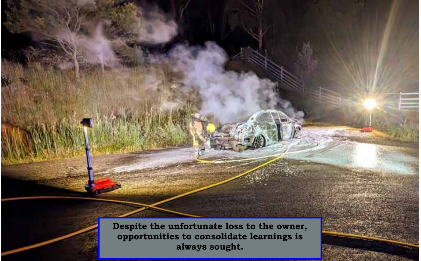
Despite the unfortunate loss to the owner, opportunities to consolidate learnings is always sought.