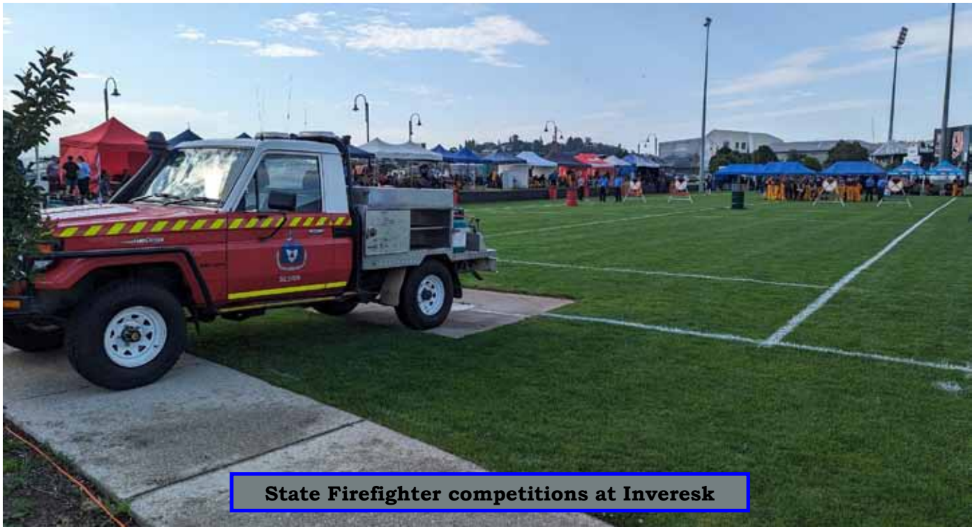
State Firefighter competitions at Inveresk