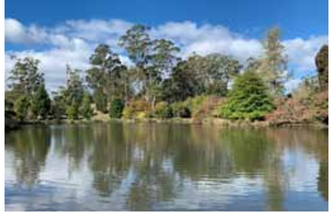
Two views of the Founders Lake at the Arboretum