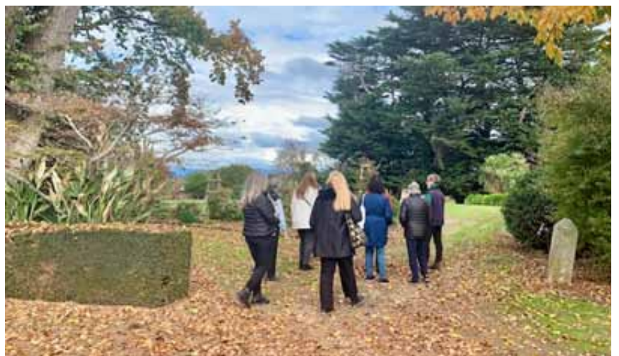
Garden Club members heading into the gardens

Dilston Windermere Swan Bay Garden Club's next gathering will be in June at Glebe Gardens. If you would like to be a part of Garden Club, please contact me or send an email to the address below. New members are very welcome.