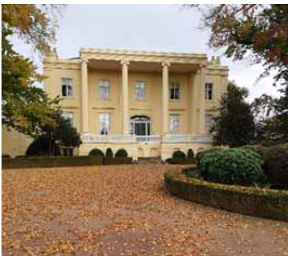
Clarendon House – built in 1830s