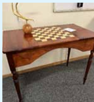
Some of Ian's Work

ETMS is assisted by equipment grants from the Tasmanian Government.