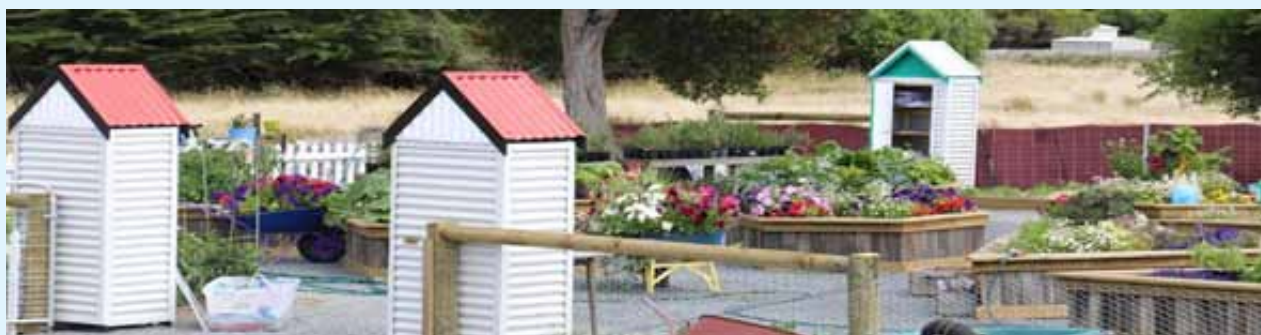
The Low Head Community Garden

As the leader and main contributor to the Low Head Community Garden project, he has left a lasting legacy for all to see. A good natured and patient teacher, always eager to lend a hand.