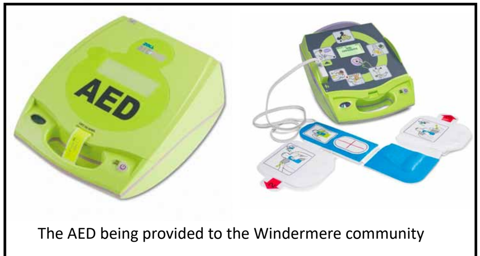
The AED being provided to the Windermere community

Chances of survival during a cardiac arrest decrease by up to 10 per cent every minute.