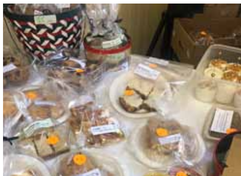
Some More Market Photos