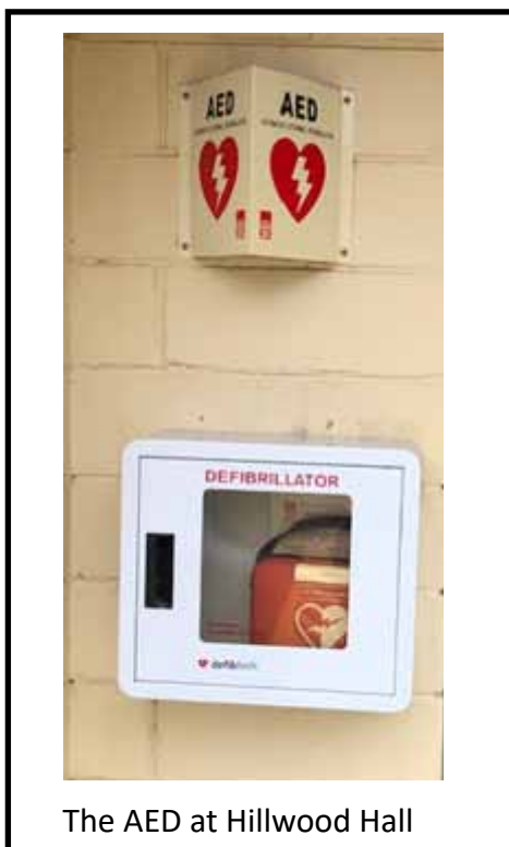
The AED at Hillwood Hall

We will provide more information in the next issue of Smoke Signals once the AED is installed.