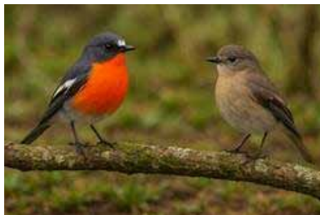
Flame Robin male & female